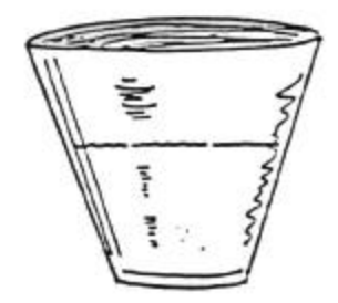
...in liquid alcohol?